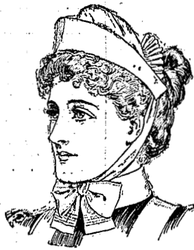
The New "Sister Dora" Cap. Made of washing Cambric, with draw strings. Can be washed as easily as a handkerchief. 1/-. Without strings, 10½d.