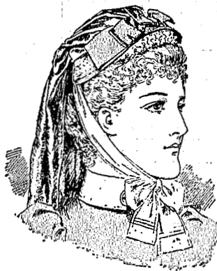
The "St. Bride's" Bonnet. Made of fine Straw with Lace and ruching, and trimmed with Ribbon, and long Silk Gossamer Fall. In black and colours, 12/6 each. Without Fall, 9/6; also